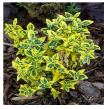
Emerald N Gold