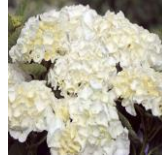
Saxon Alaska White